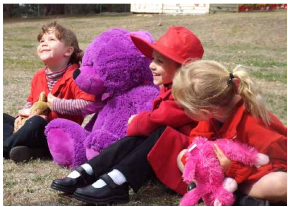
Recently, Prep students from the Buninyong campus joined with the Scotsburn P/1 class for a Teddy Bears Picnic session. Fun activities included Duck Duck Teddy and What's the Time Mr Teddy? Playing together over lunchtime was enjoyed by all.