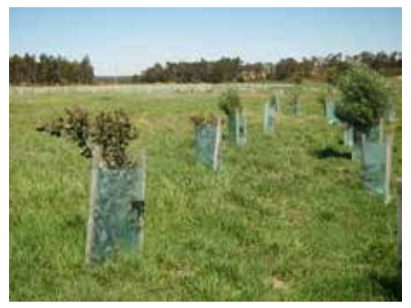
A new woodland at the end of Macs Road

Mon-Thurs: 8.30am - 5.00pm; Fri: 8.30am - 9.30pm; Sat: 12 noon to 6.00pm For appointments, phone: 5331 3128 www.28drummondnorth.com.au or find us on