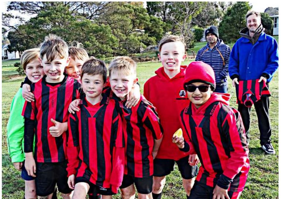
The Redbacks' U 9 soccer team is keen for the Royal Park soccer project to be funded to enable them to get out of the muddy conditions at Forest Street and have access to toilets and change rooms.

Three peak community groups have now joined with Council to lobby for funding of $500,000 for the first stage of the Warrenheip Street streetscape upgrade project.