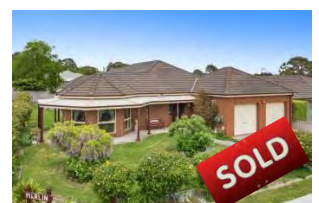
Forest Street Buninyong $699,000