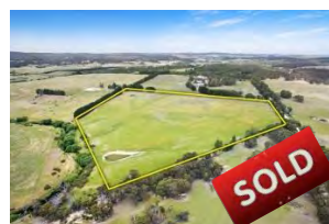
Hoveys Road, Durham Lead $395,000