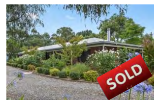
Cornish Street, Buninyong $687,500