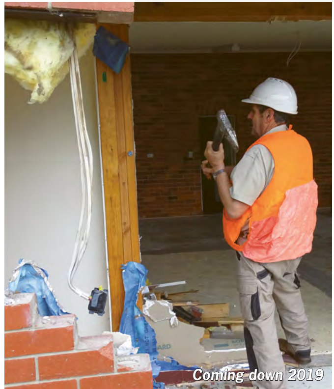
Coming down 2019