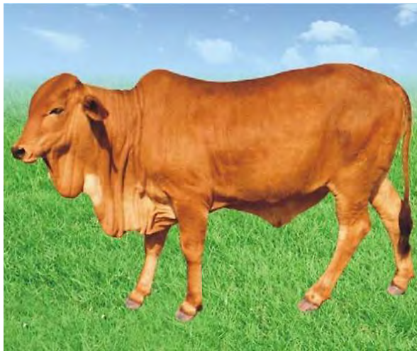
Above: The Sahiwal breed of cattle were crossed with Friesians to produce cattle that produced good milk and which were heat and tic resistant.

This project was a significant introduction for the Christian College staff and students to the urgent needs of Timor Leste. After an initial visit in 2000 the achievements of the school in the district of Viqueque have been outstanding. Many Prefects and Year 10 students have since travelled to East Timor to foster closer links between the Viqueque community and Christian College, Geelong.