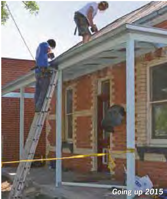
Going up 2015