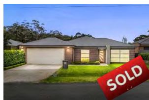
Somerville Street, Buninyong $570,000