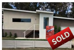
Delaland Avenue, Buninyong $560,000