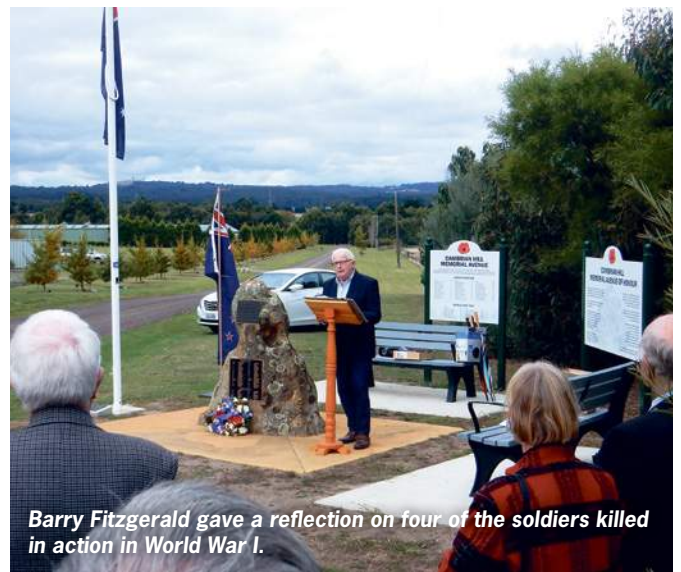
Barry Fitzgerald gave a reflection on four of the soldiers killed in action in World War I.