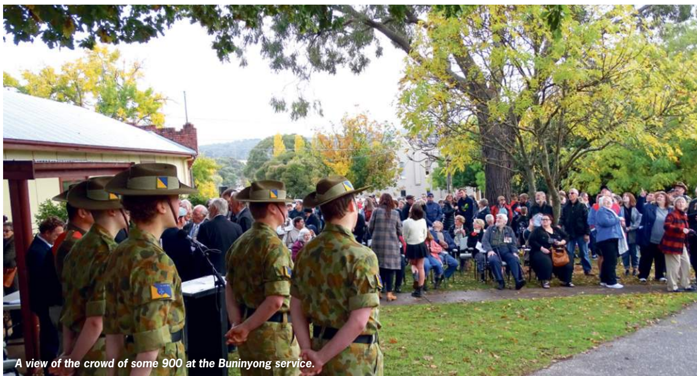
A view of the crowd of some 900 at the Buninyong service.